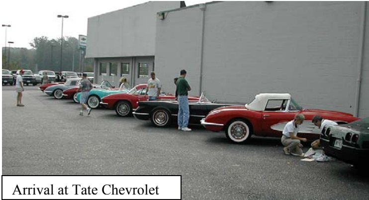
Arrival at Tate Chevrolet

37 hearty members of MASACC converged on Annapolis, MD in 14 solid axle Corvettes and were rewarded with 90 degree, sunny weather. The day started at Tate Chevrolet with two technical sessions.