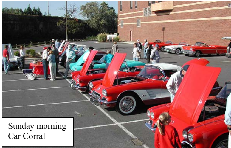
Sunday morning Car Corral

Thanks are extended to all the Chapter members who attended this event. Next year MASACC plans call for an April 26-27 event in Williamsburg, Virginia, a meeting at Corvettes@Carlisle on August 24, and a Hudson Valley, New York, event in October.