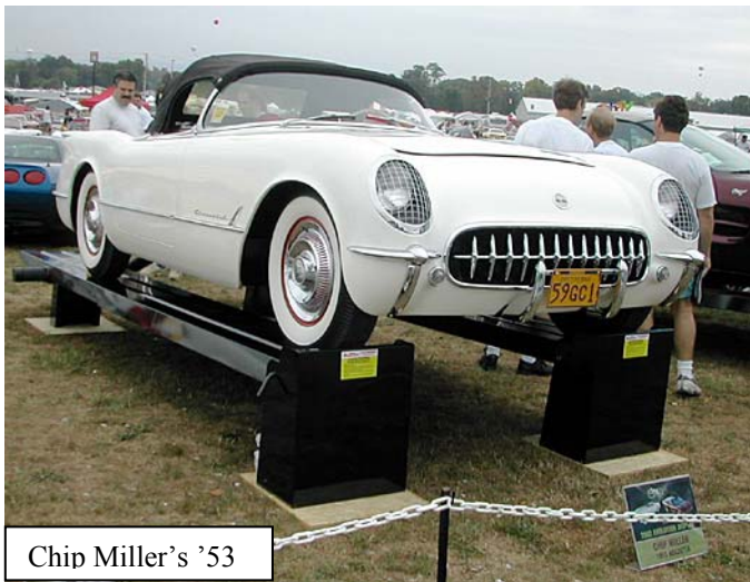
Chip Miller's '53