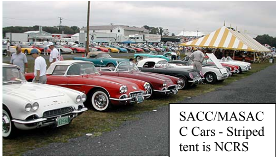
SACC/MASACC C Cars - Striped tent is NCRS