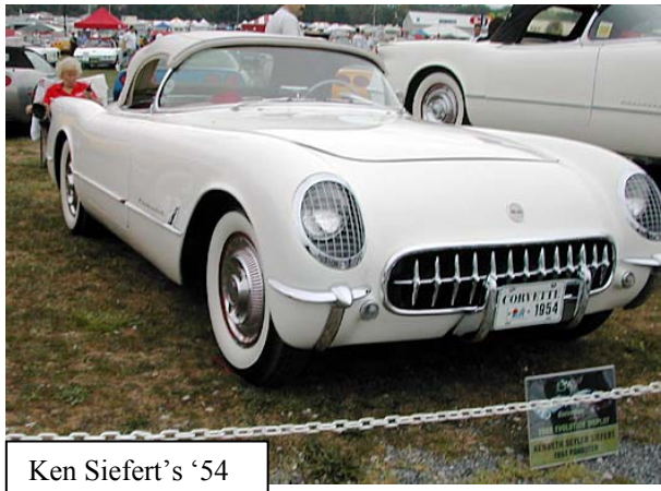
Ken Siefert's '54

The Evolution display started with Chip Miller's '53 and proceeded in a large clockwise oval until it ended with a 2003 convertible. It would seem that every production 'Vette was represented in the display - very nice!!!! The solid axle cars found in the display are displayed here. Wonderful exhibit - hope we are all here for the 100 th Anniversary.