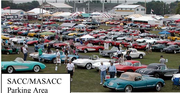
SACC/MASACC Parking Area