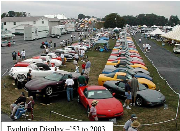
Evolution Display - '53 to 2003