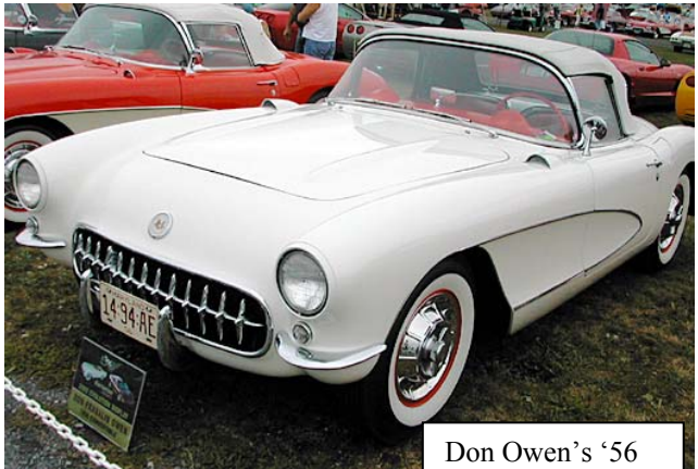
Don Owen's '56