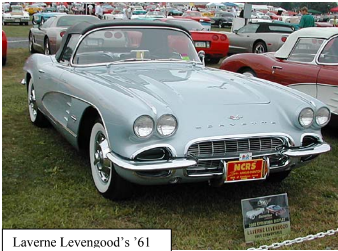
Laverne Levensgood's '61