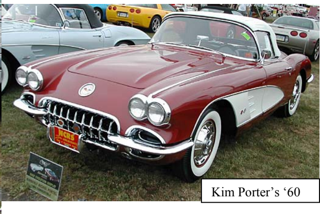
Kim Porter's '60