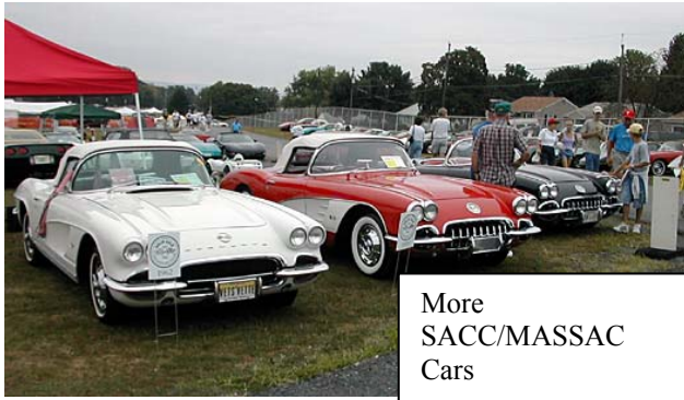
More SACC/MASSAC Cars